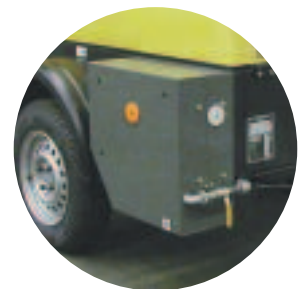
Pneumatic hose reel