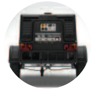
Road Light System

The compressor can be easily moved by the operator without external help.