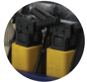
Tool Storage Area